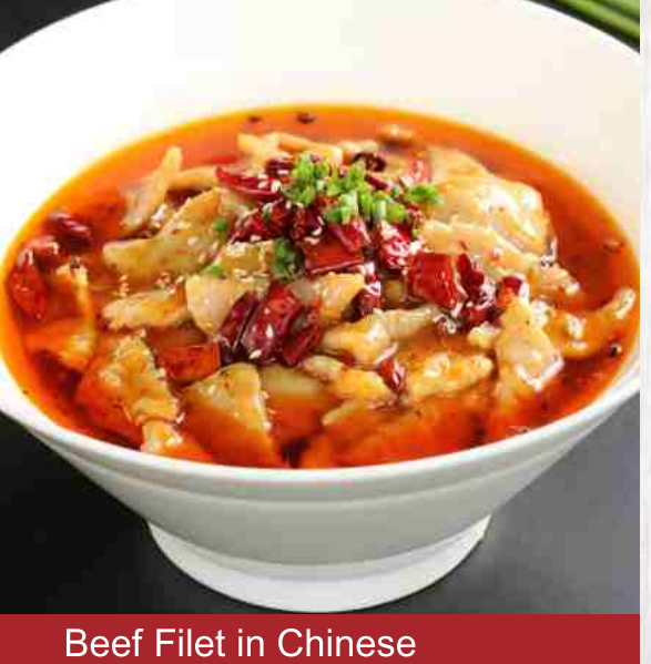
Traditional Hot & Spicy Soup